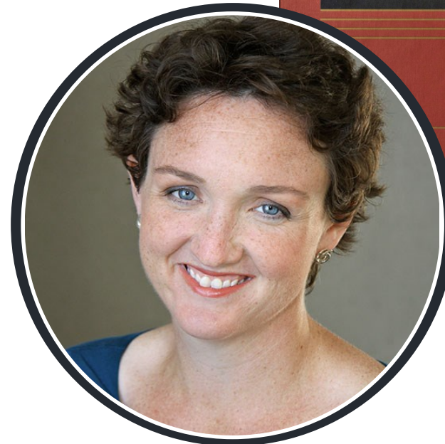
Modern Consumer Law. Wolters Kluwer, 2016.