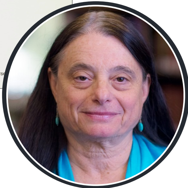
Mediation and its Applications for Good Decision Making and Dispute Resolution. Intersentia, 2016.